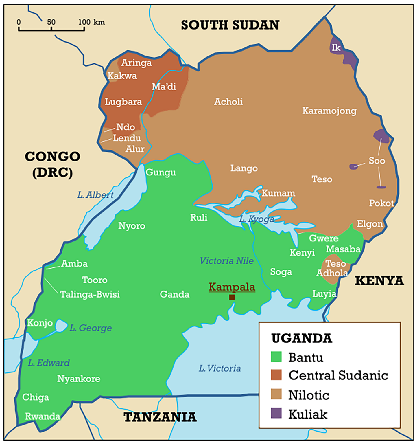
Fig 3. Map of Uganda showing the distribution of ethnolinguistic groups.

https://doi.org/10.1371/journal.pone.0195431.g003