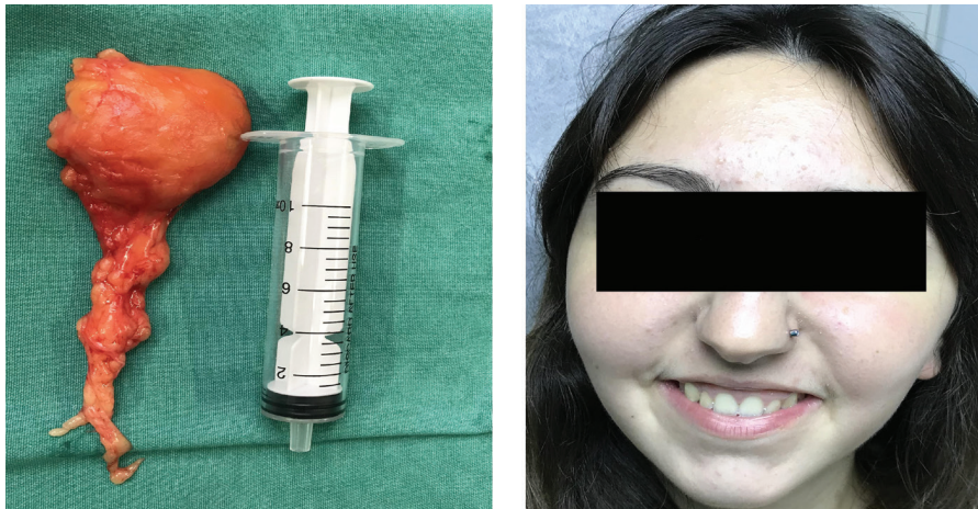
Fig. 3: A) The lipoma of the right side after removal. B) The patient two weeks after surgery.