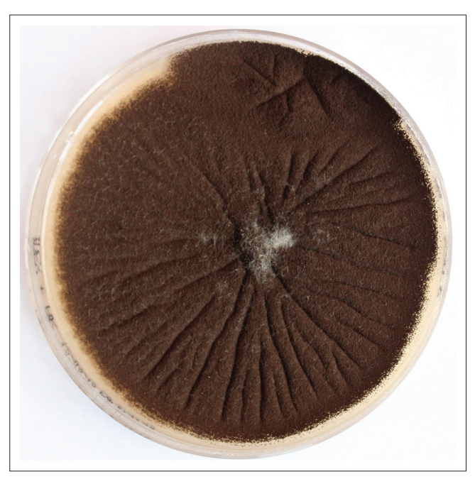
FIGURE 1: Characteristic black sporing heads of Aspergillus niger covering white mycelium macroscopically, grown at 35° C on Sabouraud Dextrose media with amikacin.