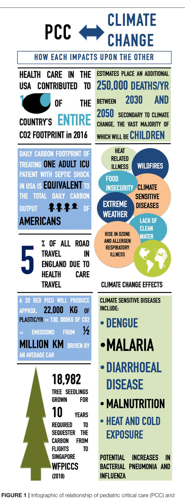
FIGURE 1 Infographic of relationship of pediatric critical care (PCC) ar climate change.

• 2019 Lancet Countdown Indicator 3.9: mitigation in the health care sector, healthcare sector greenhouse gas emissions.