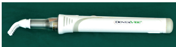
Fig. 2. DentalVibe

DentalVibe is a cordless, rechargeable, handheld device (Fig. 2) that delivers pulsed micro-oscillations to the injection site. It requires no modification to be made to the traditional anesthetic technique [12]. DentalVibe is designed such that it retracts the buccal or labial mucosa. It can be held easily and operated with the non-working