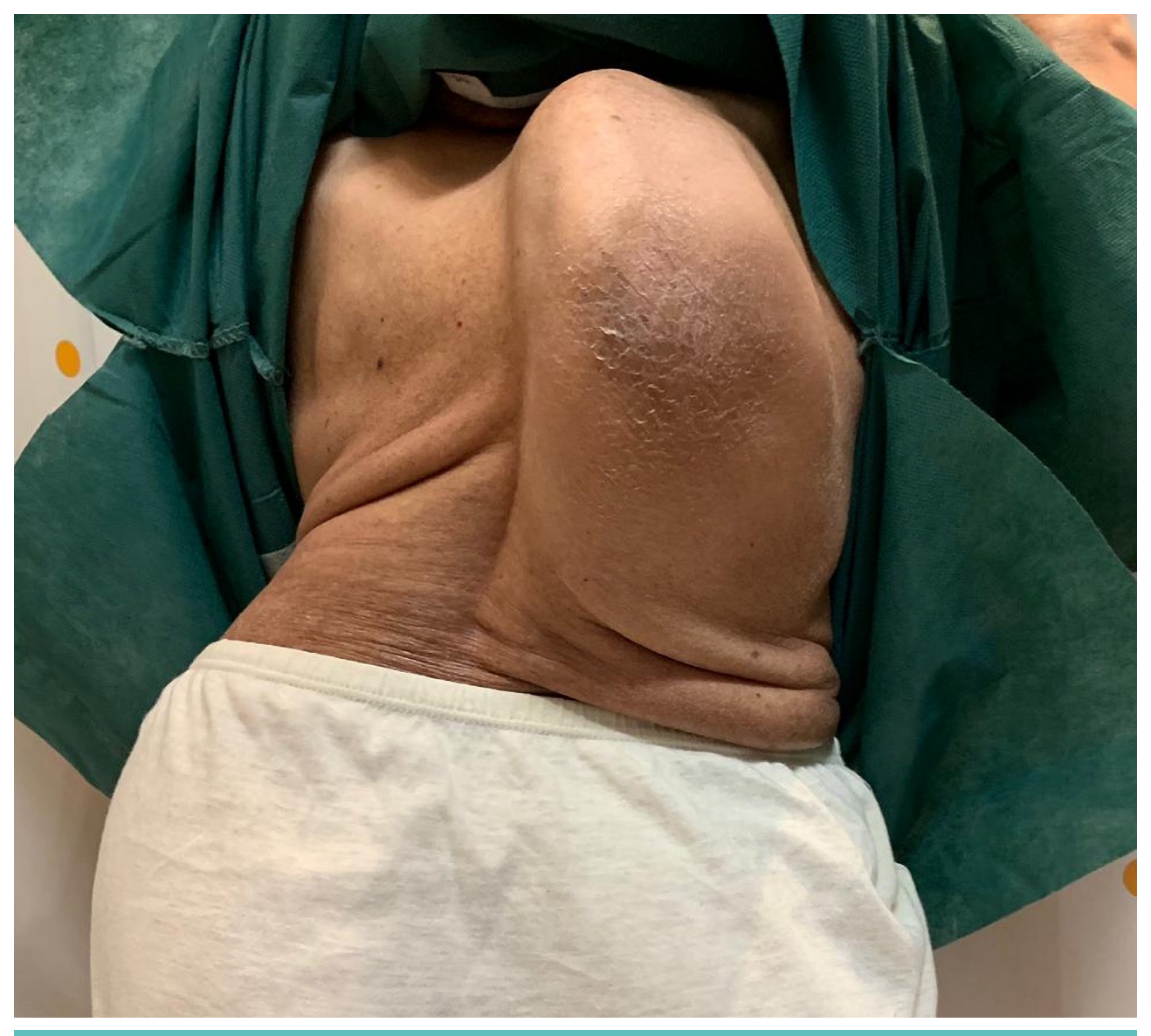
Figure 1. Photograph of the outer appearance of the patient, calcification of skin appeared at the right posterior rib cage area.

A weight-bearing, full spine radiograph (EOS image) showed kyphoscoliosis with a right-sided head tilt and spinal convexity, crowding of left-sided ribs, and sclerotic changes on the bilateral tibia, in addition to bilateral genu valgum. The thoracic spine was curved in the lateral plane at 172° Cobb angle (Figure 2), with the convexity directed towards the right. The upper portion of the thoracic spine