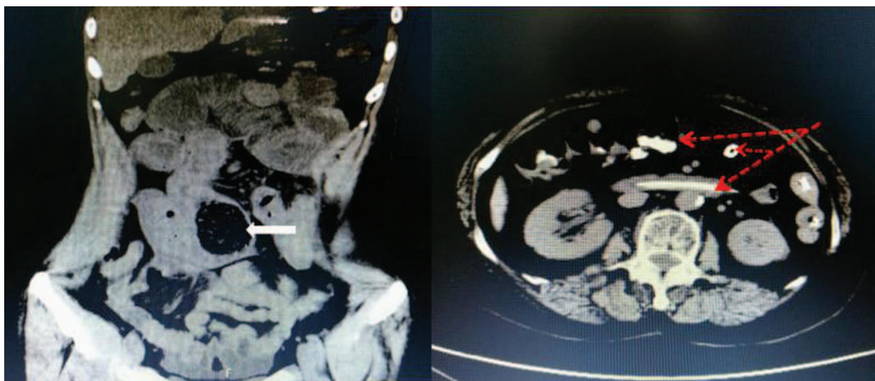
Figure 1. A, Abdominal CT scan shows an intestinal mass considered to be a phytobezoar (white arrow), and shows proximal intestinal dilatation and intestinal effusion. B, The red arrow indicates the long intestinal tube placed in the intestinal cavity, showing bezoar disintegrating, decreased expansion of the bowel after decompression and significantly reduced intestinal effusion.

August 2018 were included in this retrospective study. The data were collected from patient charts and electronic medical records of the patients with Intestinal obstruction (ICD-10 code K56.4) in Zibo central hospital. All the patients were assigned to either of the following groups based on the method of tube insertion: conventional group (NGT group) or intervention group (LT group).