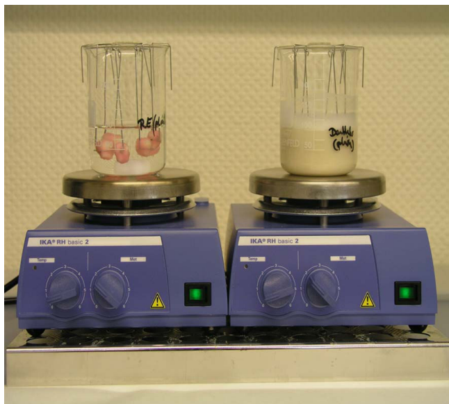
Figure 1 Setup of the incubation procedure. The wax coated teeth were fixed to metal wires and were hanging in the different incubation media. The incubation media were constantly slowly agitated with a magnetic stirrer.

of each solution was 100 ml. These solutions were constantly agitated using a magnetic stirrer. All cycles were executed under constant climatic conditions at 37°. The window areas were microphotographically controlled before pH-cycling to discard specimens with enamel cracks of iatrogenic scratches and to document the artificial white spot lesions after 18 days.