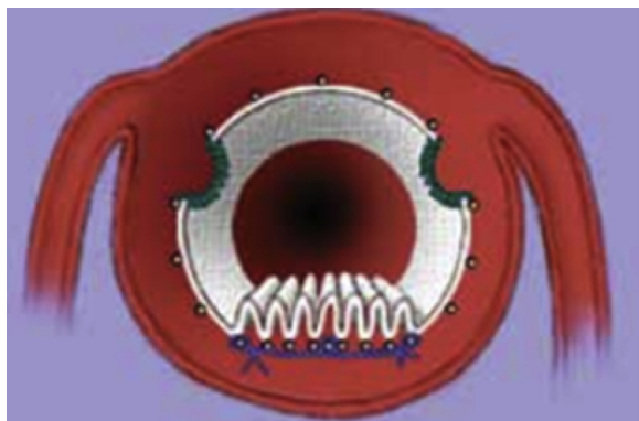
Fig 4. Diagram of a fenestrated graft demonstrating the asymmetric, posterior-oriented diameter-reducing ties. (From Oderich GS. Fenestrated stent graft repair for complex aneurysms. Endovasc Today 2013;May[Suppl]:16-26. Reprinted with permission.)

abdominal aorta, 11 and our case is the first report of infolding in a fenestrated or branch graft.