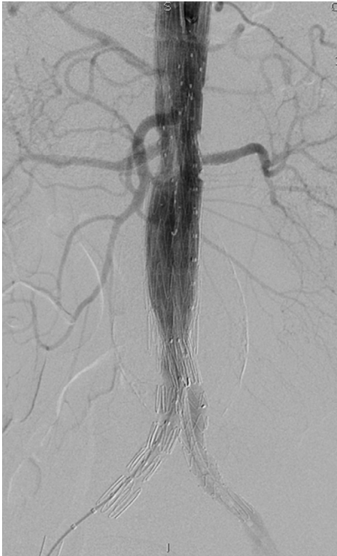
Fig 1. Completion angiogram showing excellent visceral perfusion with no endoleak. No abnormality was noted at implantation.

going into the celiac artery. Because the proximal celiac artery had a significant stenosis, we thought that a stent would not be required for either visceral perfusion or sealing of the aneurysm. The bifurcated segment of the fenestrated graft was then inserted without incident. We ballooned the overlap segments of the bifurcated graft, but no ballooning was done over the visceral component. Completion angiography revealed no endoleak and excellent visualization of all visceral vessels (Fig 1). The patient was discharged home on the fourth postoperative day in excellent condition.