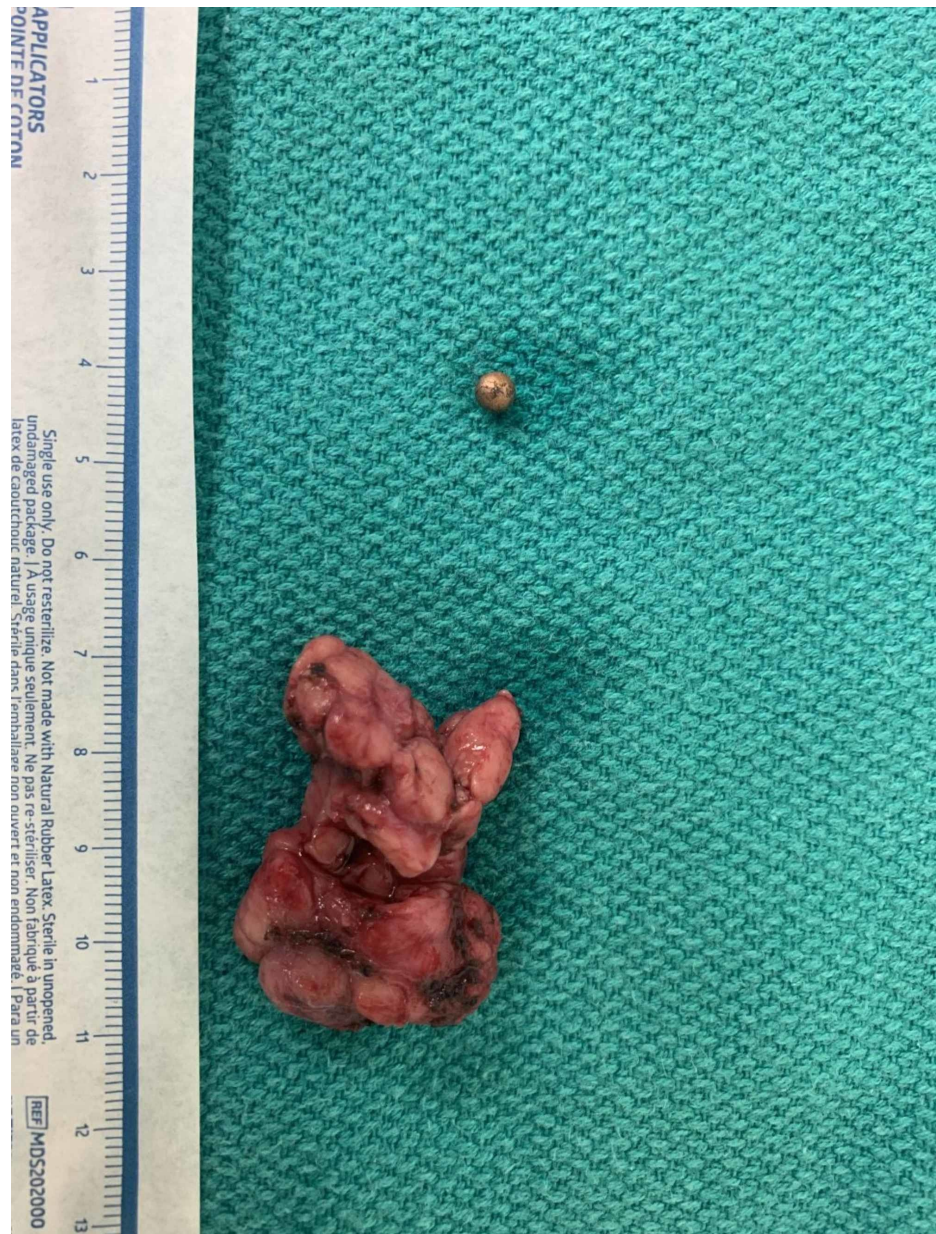
FIGURE 2: Extracted submandibular gland and BB gun pellet