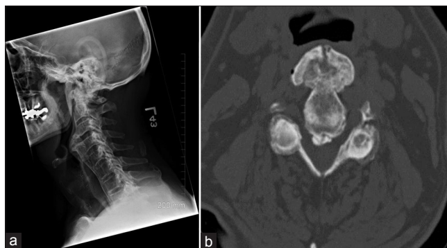
Figure 1: (a) Pre-operative plain radiograph of the neck showing anterior cervical osteophytes at the level of the epiglottis, (b) Pre-operative computerized tomogram showing the anterior cervical osteophyte at the level of the epiglottis with size equal to that of vertebral body

The surgeons performed a left-sided anterior neck approach to the cervical spine and then proceeded to dissect the pharynx off of the osteophytes. The dissection was carried down to the pre-vertebral fascia covering the osteophytes. They removed the anterior osteophytes from C3 to 5. After removal of the bony elements, the pharynx was once again evaluated to make sure there was no soft-tissue pathology. The neck was closed in layers. Throughout the surgery, all monitored parameters remained stable.