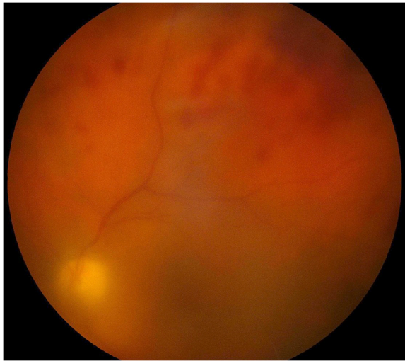
Figure 1 Left-eye fundus photo 1 week after the initial presentation with dense vitritis and retinal hemorrhages.