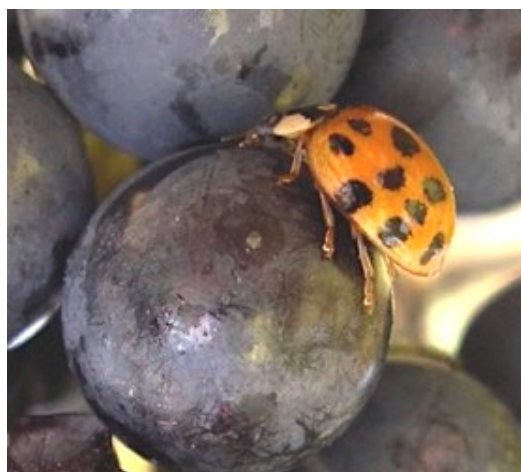
Figure 1. A Harmonia axyridis (MALB) beetle on a grape berry prior to harvest.

authors added MALBs to red and white juice and must, and used descriptive analysis and a trained sensory panel to characterize the wines thus produced. White wines displayed higher intensities of bell pepper, asparagus, and peanut aroma and flavor compared with control wines, while red wines showed higher intensities of peanut, asparagus/bell pepper, and earthy/herbaceous aroma and flavor. At the same time, bitterness (more intense), sourness (more intense), and sweetness (less intense) were also affected in MALB-treated red wines, while in whites the intensity of fruit and floral descriptors was reduced compared with control wines. These effects increased with the number of beetles added to the juice/must [6].