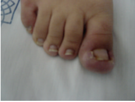
FIGURE 1: The disorder generally occurs in the great toes.