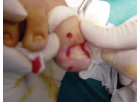
FIGURE 2: Local successful anesthesia was done.

the paronychium where the toenail corner enters the soft tissue is described. Before the beginning of the study we received ethics approval from the ethical and law center of the Shahid Beheshti University of Medical Sciences. The procedure consists of making a transposition flap of the nail wall after preliminary excision or curettage of the granulation tissue in the nail groove.