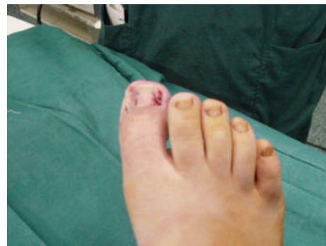
FIGURE 3: For fixing the nail margin on the toe we have done one-bite suture by Nylon.

Related to three stages of ingrown toenail (Table 1), we have 10 patients with 22 affected toes in stage one, 38 patients with 51 affected toes in stage two and 102 patients with 112 affected toes in stage three. Recurrence occurred in only