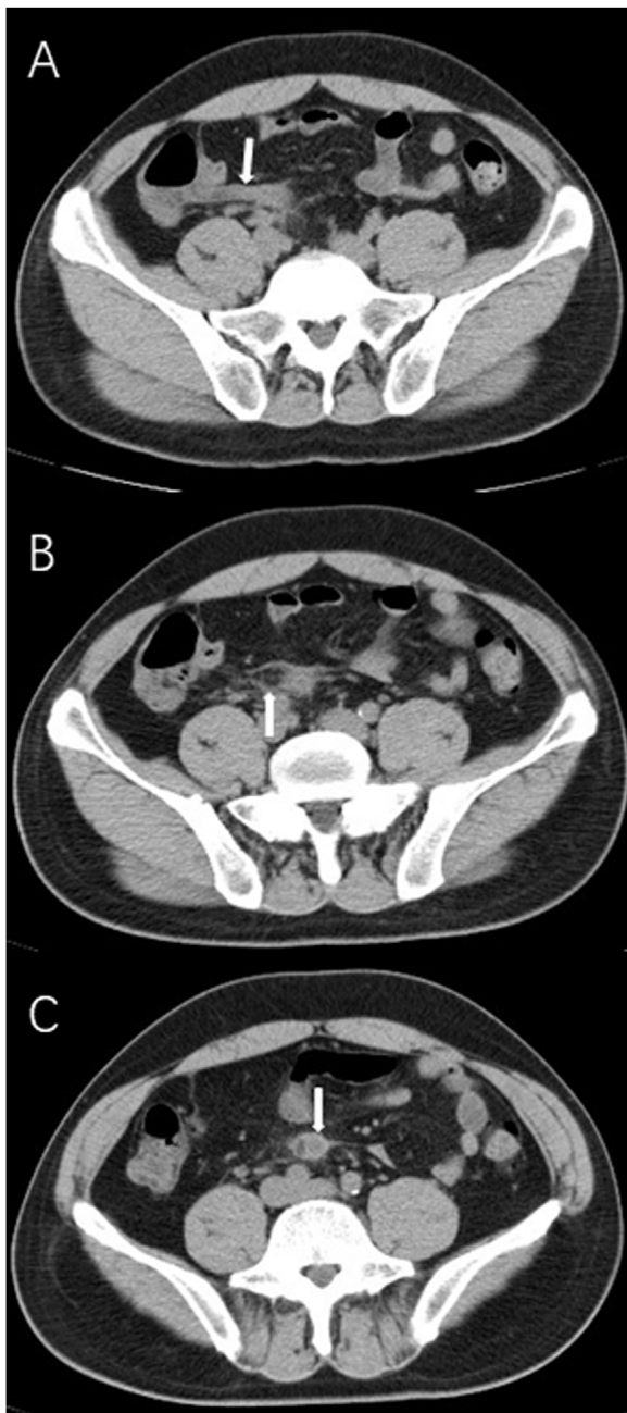
Fig. 1. CT demonstrated a thickened appendix (A), swollen mesoappendix (B) and enlarged tip of the appendix (C).

inal wall. After lysis of the abdominal adhesions, the inflamed appendix with a thickened and congestive distal end, and swollen mesoappendix, which lied between the terminal ileum and the posterior peritoneum, became visible. Then, we inserted an additional 5 mm trocar at the McBurney point to obtain better visualization.