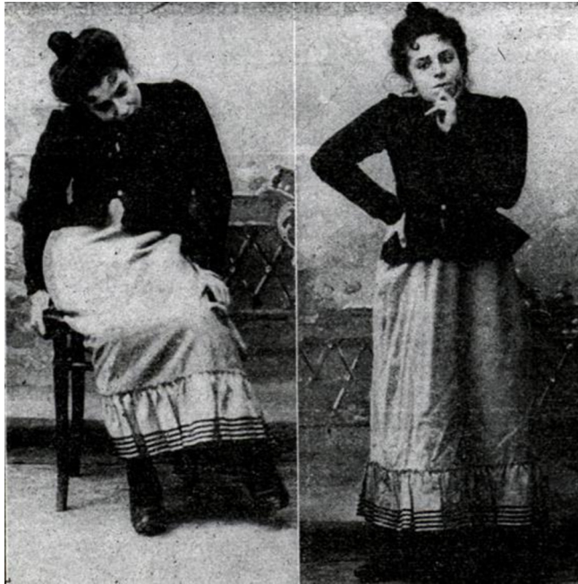
Figure 1 A classical picture of sensory trick ( geste antagoniste ) in spasmodic torticollis. 5 Left : without trick. Right : abnormal posture is corrected by placing the right hand on the hip bone and touching the chin with the left hand.

Detailed immunohistochemical studies have suggested that the striatal projection neurons (medium spiny neurons (MSNs)) affected in the early dystonic phase of the disease likely are located in striosomes, a neurochemically defined compartment in the striatum, as opposed to the striatal matrix, for which a marker (calbindin) remained (figure 2). No recognisable abnormalities were observed in the cerebellum in these cases.