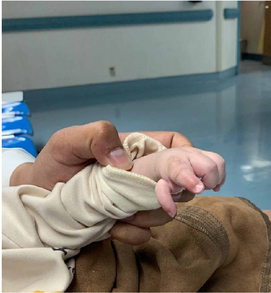
FIGURE 1: Hypo-plastic left thumb

Regarding the investigation, his blood work was within normal limits except for a low serum creatinine of 13 \mu\text{mol/L} (normal range: 71-133 \mu\text{mol/L} ) and hyponatremia of 130 mEq/L. Meanwhile, his brain magnetic resonance imaging (MRI) showed mild periventricular leukomalacia, benign external hydrocephalus, with the suggestion of Blake's pouch cyst (Figure 2). The genetic investigation was performed for the patient, and he was found to have chromodomain helicase DNA-binding protein 7 (CHD7), c.2572C>T p(Arg858), and the diagnosis of CHARGE syndrome was confirmed based on the physical examination and the gene sequencing report. The patient is in hospital and is followed up by a multidisciplinary team consisting of a cardiologist, neurologist, nephrologist, general pediatrician, gastroenterologist, otolaryngologist, ophthalmologist, pulmonologist, and physiotherapist with a plan to try and increase and improve his life expectancy and quality of life moving forward.