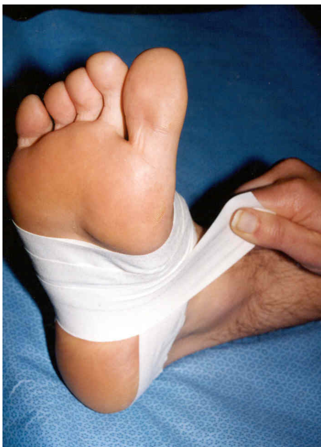
Figure 1 Low-Dye taping.

Participants in the taping group were then taped using the low-Dye taping technique[13] (participants allocated the sham treatment did not receive tape). The skin was first swabbed with alcohol and then Leuko® Spray Adhesive (Beiersdorf Australasia Ltd) was sprayed on the foot to assist tape adhesion. Low-Dye taping was then sequentially applied using Leuko® Premium Plus (flesh coloured) Sports Tape 3.8 cm wide (Beiersdorf Australasia Ltd.). The technique used (Figure 1) has been described in detail elsewhere[13]. Tape required for one application cost approximately AU$1.00. In the absence of adverse events, participants allocated to taping were instructed to leave the tape on until their follow-up appointment (one week later). Care was taken that study participants did not meet by ensuring they exited the building by a different doorway to the one through which they entered.