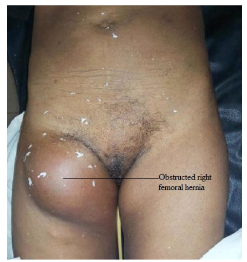
Figure 1 Obstructed right femoral hernia at presentation

Abdominal ultrasound scan demonstrated a heterogeneous mass lateral to the femoral vessels that appeared to be arising from the abdominal cavity through a defect of 10.1mm in diameter. The mass measured 4.6cm in diameter and contained bowel loops with reduced vascular flow on doppler. The bowel loops had increased intraluminal fluid and were surrounded by echo-rich fluid. A diagnosis of obstructed right femoral hernia to rule out strangulation was made. Patient was resuscitated with intravenous fluids, placed on antibiotics, and had electrolyte abnormality corrected. She was prepared and booked for emergency operation to relieve the obstruction in the femoral hernia by the consultant surgeon. The mass was approached through an infra-inguinal transverse incision (Figure 2).