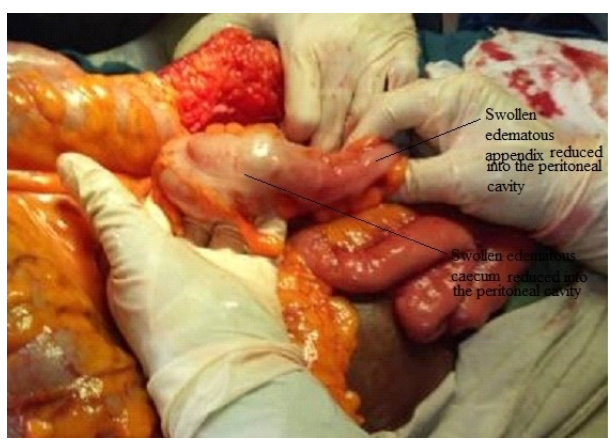
Figure 3 Edematous caecum and appendix reduced into the peritoneal cavity through laparotomy