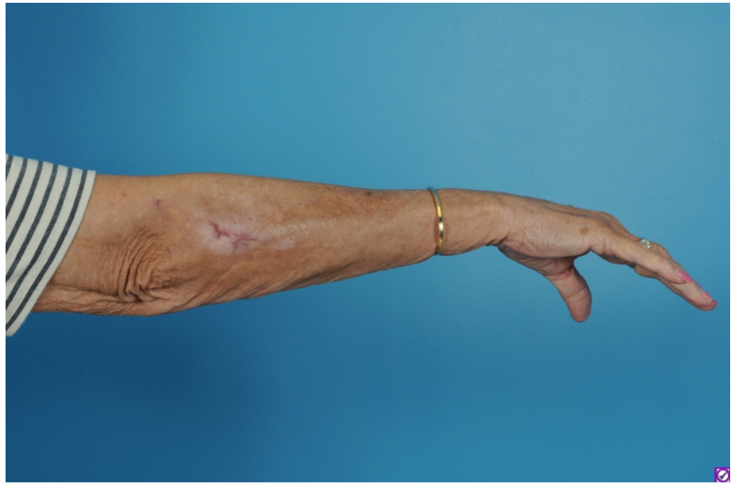
FIGURE 3: Three-month post-operative photo