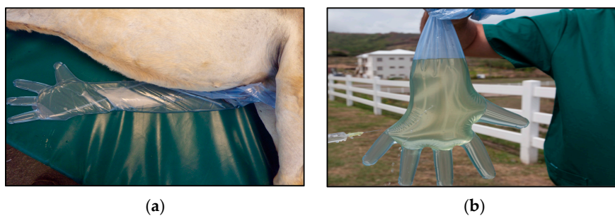
Figure 1. (a) Donkey under general anesthesia with palpation glove to collect urine; (b) Aspiration of urine sample into sterile syringe for collection.

Urine samples from 124 donkeys were collected during the seventh semester Large Animal Surgery labs. All animals received humane care in compliance with the “Principles of Laboratory Animal Care” formulated by the National Society for Medical Research and the “Guide for the Care and Use of Laboratory Animals” prepared by the National Institutes of Health. Clinical data were recorded from each donkey, which included age, gender, temperature, heart rate, respiratory rate, urine color, and examination of left and right eye. Donkeys were placed under general anesthesia, and urine was collected in palpation gloves (Figure 1). Ten milliliters of urine was collected from each donkey and centrifuged at 3000 \times g for 30 min at room temperature. The supernatant was aspirated and discarded. The remaining pellet was mixed by vortexing for 30 s and then frozen at -80^\circ\text{C} until DNA extractions were performed. Water from two troughs in the donkey pasture was collected and processed as described elsewhere [6].