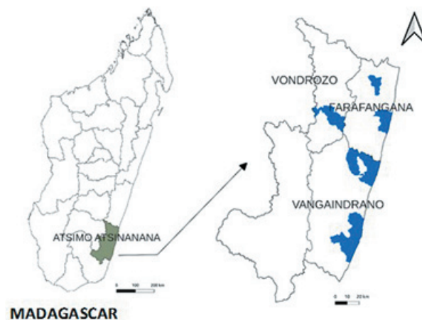
FIGURE 1 Municipalities where research was conducted in the Atsimo Atsinanana region (blue-shaded areas).

In this case study from rural Madagascar, a participatory methodology was applied to assess gender-disaggregated priorities, preferences, and multidimensional ex ante impact expectations regarding FNS interventions. To inform effective development strategies in the study region, our goal is to identify interventions that are likely to be adopted and have strong positive effects. To this end, we elicited intervention preferences