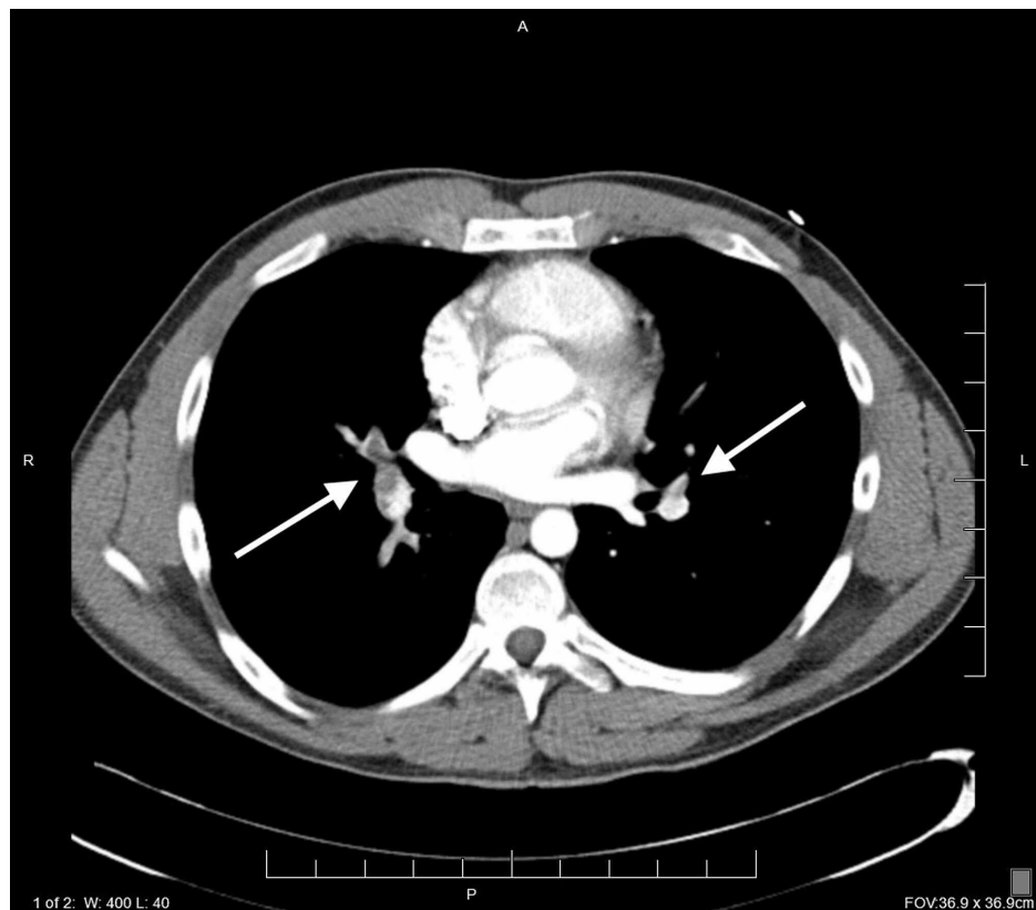
FIGURE 2: CT angiogram demonstrating filling defects in branches of pulmonary arteries bilaterally in keeping with pulmonary emboli.

Given the suspected diagnosis of PE, the patient was administered two doses of enoxaparin 90 mg subcutaneously and was admitted overnight for observation. After 48 hours, the patient was discharged from