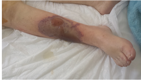
FIGURE 1: Patient's right leg at presentation to the vascular department.