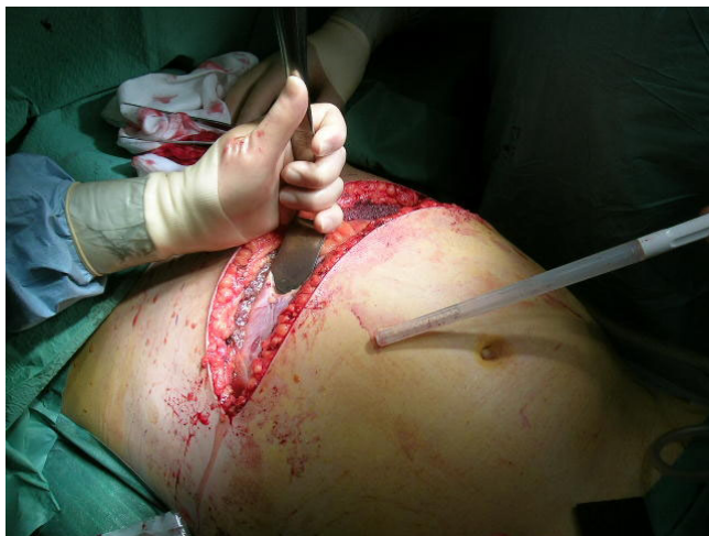
Figure 1 Decompressive transverse laparostomy.

When selecting the optimal technique for surgical decompression, previous already existing recent abdominal incisions (wounds) are preferable. If a patient has undergone a midline laparotomy, utilizing the same incision for decompression is obviously the best choice. In patients with secondary ACS and particularly those without previous abdominal incisions, several options exist. The most commonly used method for surgical decompression is the midline laparostomy [4]. All layers (skin, fascia, peritoneum) are divided through a vertical midline incision extending from the xiphoid to the pubis with a few centimeters of fascia left intact at both ends to facilitate subsequent closure or late reconstruction. Alternatively, a transverse bilaterally extended incision few centimeters below the costal margins can be used to perform a full-thickness laparostomy [5] (Fig. 1). A third method utilizes