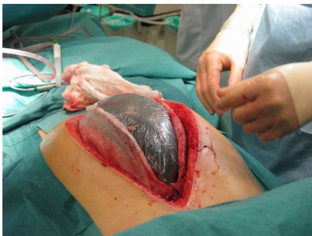
Figure 3 Vacuum-dressing with temporary mesh being changed.

Once the ACS has been treated, the most important aim is to achieve primary fascial closure as soon as possible without causing recurrent ACS or other complications associated with premature closure [16]. If the infection source has been controlled and even if a relaparotomy might be needed in the near future, every effort should be made to achieve primary fascial closure during the initial hospitalization period and avoid the significant morbidity associ-