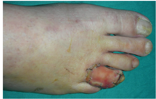
FIGURE 4: Postop at three weeks.

of cases are reported in women, and two-thirds of cases are reported in black persons. It most commonly occurs between the fourth and sixth decades of life. The neof ormation can affect all parts of the body with the highest concentration in areas with highest concentration of peripheral nerves. The head and neck areas are affected in 50% of cases and of these, 70% are located interorally (tongue, oral mucosa, and hard palate). The cutis and the subcutaneous tissue are affected in 30% of cases, the breasts in 15%, and the respiratory system in 10% of cases. Only 1% to 3% of all reported cases are malignant [1].