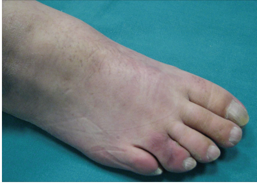
FIGURE 5: Clinical follow-up at one year.

reconstruction with a dermal regeneration template. The clinical followups have shown no relapse of the disease and complete resolution of the pain.