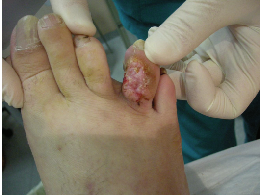
FIGURE 1: Granular cell tumor of the fourth toe of the right foot.