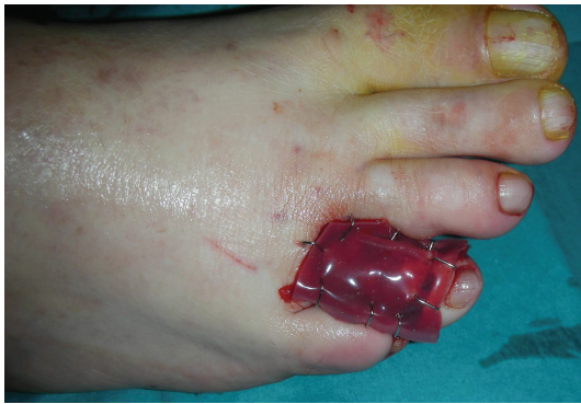
FIGURE 2: Immediate postop: reconstruction of the fourth digit with the dermal regeneration template (Integra).