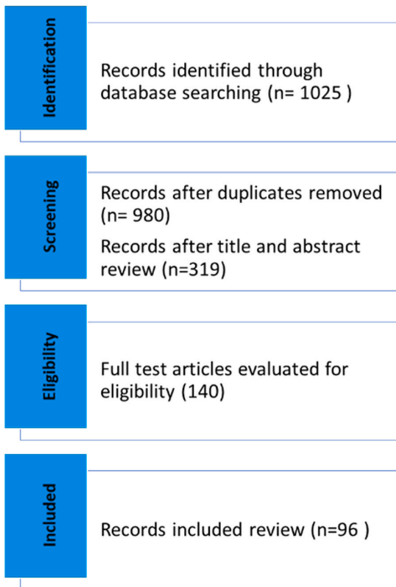
Fig. 1. Flowchart of included studies.

Studies included in this review were tabulated according to the three major types of fatal adverse effects: anaphylaxis (Table 1), myocarditis (Table 2) and thrombotic events (Table 3). All included studies were cohort designs and case report, and most of the studies are conducted based on registry databases.