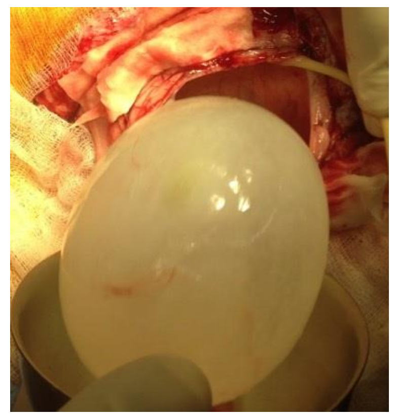
Figure 2: Large hydatid cyst delivered without rupture