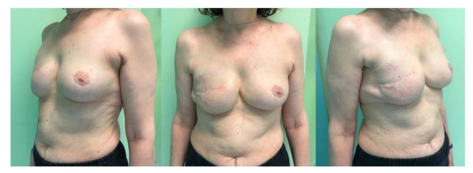
Figure 3. Post-operative pictures of a 62-year-old patient at 15-month follow-up. A 285 cc anatomical breast implant was used to reconstruct the right breast. In the early post-operative period, the patient presented a superficial necrosis of the upper and lower mastectomy flap, which was treated conservatively. The patient was highly satisfied with the aesthetic result (VAS 9 out of 10).

Figure 2. Post-operative result of a 68-year-old patient at 18-month follow-up. The right breast was reconstructed using a 320 cc anatomical implant. A contralateral reduction mammaplasty was performed in the same operative time. The aesthetic outcome reached scores of 7/10 and 6/10, according to patient and surgeon, respectively. The patient refused a fat grafting procedure to correct the medial rippling.