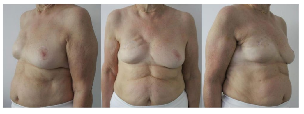
Figure 2. Post-operative result of a 68-year-old patient at 18-month follow-up. The right breast was reconstructed using a 320 cc anatomical implant. A contralateral reduction mammaplasty was performed in the same operative time. The aesthetic outcome reached scores of 7/10 and 6/10, according to patient and surgeon, respectively. The patient refused a fat grafting procedure to correct the medial rippling.