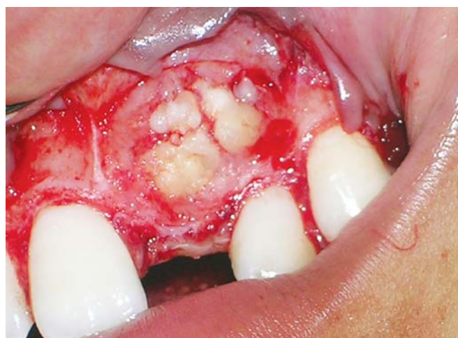
Fig. 4: Surgical exposure of the lesion showing numerous calcified masses