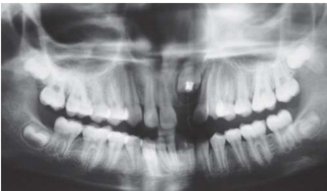
Fig. 9: One week postoperative panoramic radiograph revealing proper placement of bracket and absence of any radiopaque masses