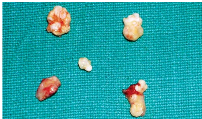
Fig. 5: Excised calcified masses

The patient was subjected to surgical removal of the odontome under local anesthesia. Full thickness mucoperiosteal flap was reflected from the labial surface of right maxillary permanent lateral incisor to left maxillary permanent canine. The layer of bone overlying the mass was removed and the calcified masses were exposed (Fig. 4). The four to five calcified irregular masses were removed without disturbing the underlying tooth and send for histopathological examination (Fig. 5). Curettage was done and the area was irrigated with povidineiodine solution and normal saline (0.9%). Unerupted left maxillary permanent central incisor was located (Fig. 6) and after hemostasis, begg's bracket with a twisted ligature wire in a hook form tied to it was bonded on the labial surface of the impacted incisor. The flap was repositioned and sutured, keeping the ligature wire hook suspended in the oral cavity making sure the occlusion was not disturbed (Fig. 7). Microscopically, hematoxylin and eosin-stained (H&E) section showed structures exhibiting an irregular arrangement of dentin, mesenchymal tissue resembling pulp and a small area of cementum-like material (Fig. 8). Overall clinicopathological correlation was suggestive of complex odontome.