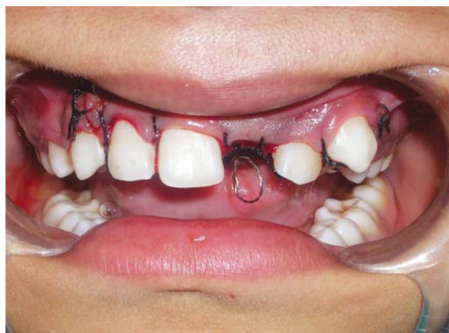
Fig. 7: Flap repositioned and sutured with ligature wire hook suspended in the oral cavity