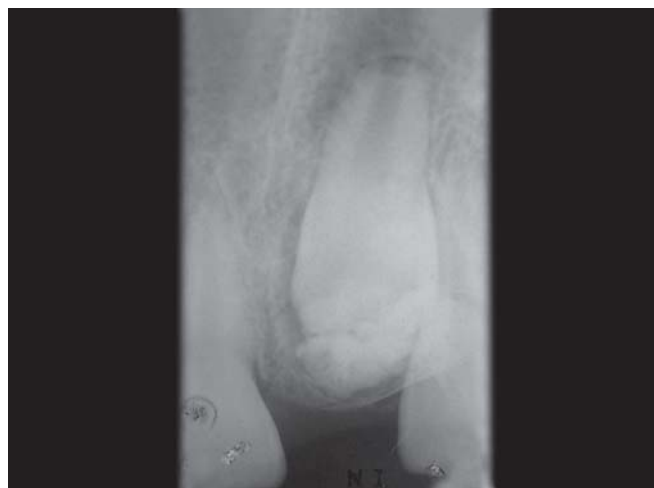
Fig. 2: Intraoral periapical radiograph showing multilocular radiopacity enveloping the unerupted incisor with incomplete root formation