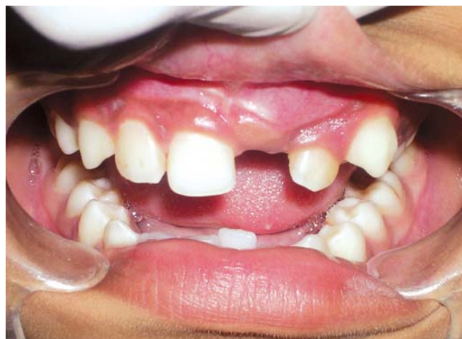
Fig. 1: Intraoral view of the patient showing unerupted left maxillary permanent central incisor with a slight bulge

Intraoral periapical and panoramic radiographs revealed that radiopaque structures were present obstructing the eruption of left maxillary permanent central incisor (Figs 2 and 3). On basis of clinical and radiographic findings, case was provisionally diagnosed as odontome. Treatment consisted of surgical removal of the odontome and bonding of begg's bracket (along with a twisted ligature wire in a hook form) to the unerupted tooth for application of orthodontic traction if required.