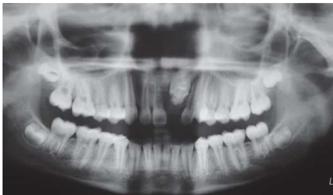
Fig. 3: Preoperative panoramic radiograph showing multilocular radiopacity