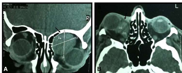
Figure 1 Orbital computed tomographic scans showing leiomyoma. (A) Coronal image. (B) Axial image. These computed tomographic scans reveal a well-defined soft tissue mass in the anterosuperior aspect of the right orbit (arrows in A and B). The mass is displacing the eyeball antero-inferiorly (A). The lesion reveals mild enhancement with intravenous contrast dye and is displacing the medial rectus muscle laterally (B). The left eyeball and rectobulbar spaces are normal.

Macroscopic inspection of the excised tumor revealed a firm, homogeneous, tannish brown specimen measuring 12cm×13cm×15cm in aggregate. The cut surface was fleshy and homogeneous and had no areas of hemorrhage. Microscopically, the tumor comprised spindle cells with