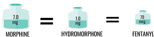
Fig. 2. Comparison of common opioid analgesic potency. Hydromorphone is approximately 7-fold more potent than morphine; fentanyl is approximately 100-fold more potent than morphine.

statistically significant improvement in pain reduction with the higher dose, though the clinically significant minimum of 1.3 NRS unit difference between the two doses was not seen. 8,106 Ultimately, close monitoring is advised and re-dosing every 30–60 min as needed to balance analgesia with adverse effect while avoiding extended periods of sub-therapeutic analgesia.