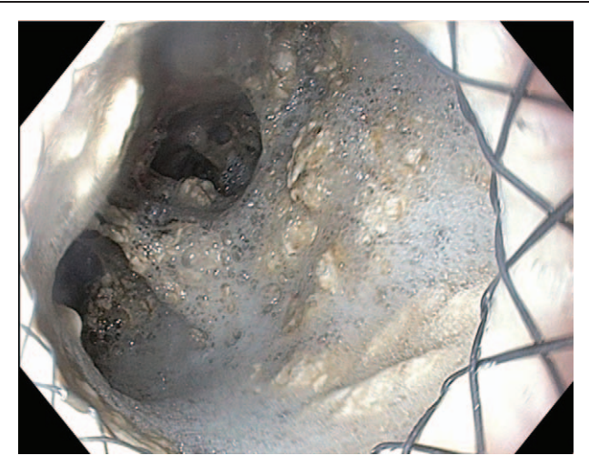
Figure 3. The appearance of the WOPN cavity after the use of H_2O_2 .