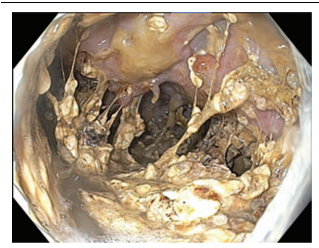
Figure 2. The appearance of the WOPN cavity before the use of H<sub>2</sub>O<sub>2</sub>.

complications such as bleeding, perforation, stent migration, and stent infection has been reported as 4% to 26%.<sup>[12,13]</sup> The amount of necrotic material in the abscess cavity is an important factor determining the success of endoscopic drainage.<sup>[6]</sup> Clogging of the stents with the necrotic material and the need for re-endoscopy reduce clinical success rate; therefore, more