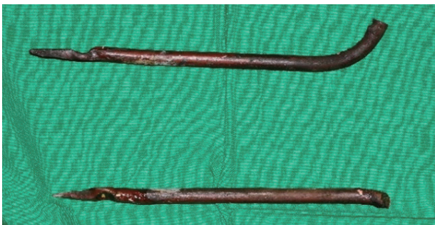
Fig. 5. Removal of rusted iron bars: 18-cm from right (upper), and 23-cm from left (lower).

ment injury patients should be considered as major trauma patient before thorough neurologic, vascular, and airway assessment are completed. Therefore the most important pre-hospital management of patients are ‘doing’ and ‘not doing’ procedures to avoid further injuries. In our case, the patient was suspended by iron fence in upside down position for 5–6 hours. If a patient is found suspended on a penetrating object, measures should be taken on site, to try to reduce the strains on the body due to gravity. The object is fixed or immobilized, like our case; the size of the piercing object should be reduced. After that, ‘not doing’ any attempt to remove the object in situ before hospital. Because doing so could cause further damage surrounding vital tissues, particularly large blood vessels and nerves.