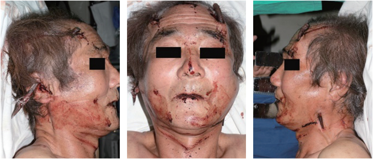
Fig. 1. A 69-year-old male with penetrating injury with rusted iron rods on his head came to the Emergency Department