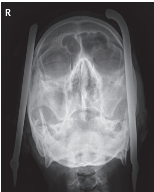
Fig. 2. Preoperative plain radiologic image.

with penetrating into right auricle and left masticator space and left lateral neck with no definite parotid gland penetration (Figs. 3, 4). He was admitted to the plastic surgical department and got emergent operation for removal of foreign bodies under general anesthesia (Fig. 5). After removal of the materials, the tunneling wounds on his both parietal areas were massively irrigated with normal saline and surgical drains were placed to prevent hematoma