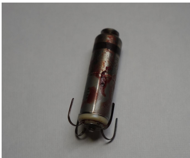
Figure 2 The retrieved device has retained its original form.

we used an Agilis sheath as the second sheath. (However, we should use a nondeflectable sheath as the second sheath from the viewpoint of cost.) A prior report used 2 snares through 1 sheath system. 3 However, this can be technically challenging, because it is hard to control the second snare well. Fichtner and colleagues 4 reported a method using a double sheath and double snare. They used 2 snares to retrieve a Micra, because the Micra was caught on the tricuspid valve and could not be retrieved with a single snare. The device was retrieved into the leadless pacemaker delivery sheath with both the snared tine and the body of the capsule, which is different from our method. It has been reported that it took a very long time to retrieve the Micra. 4 Once a TPS is floating in the heart, the tines of the TPS will be stacked by the chordae tendinae of the tricuspid valve, or the TPS will migrate to the pulmonary artery; thus, it is important to catch the TPS immediately. While a hold was maintained on the TPS, the retrieval feature on the device could be grabbed with the second snare, and then the first snare could release the TPS. The neck of the second snare should be caught with the first snare, and then the Micra can be properly aligned and extracted completely. The retrieved device retained its original form, which showed the suitability of this procedure (Figure 2).