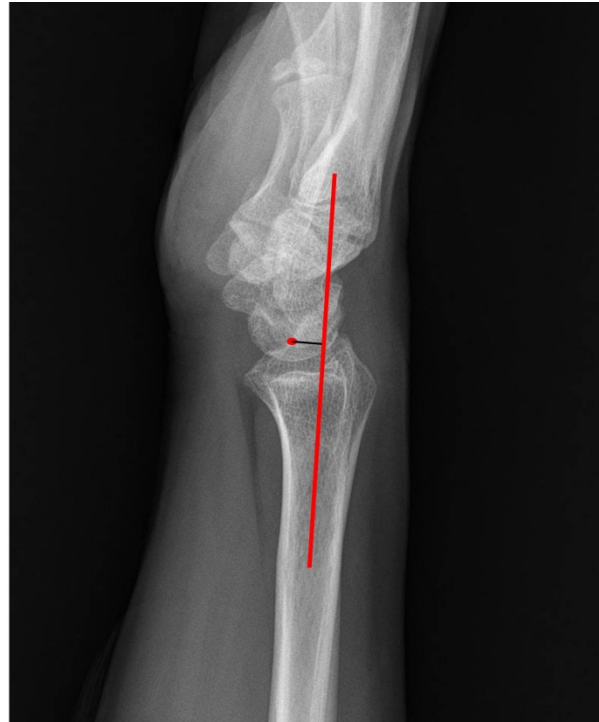
Figure 1. The LARD was defined as the perpendicular distance from the center of the lunate to the sagittal axis of the radius shaft.

surface) and ulna (fovea). The RLA is the angle between the longitudinal axes of the radius and lunate in the lateral view. We marked negative values when the lunate was inclined to volar flexion and positive values when it was inclined to dorsiflexion. The LARD was defined as the perpendicular distance from the center of the lunate to the sagittal axis of the radius shaft (Figure 1).