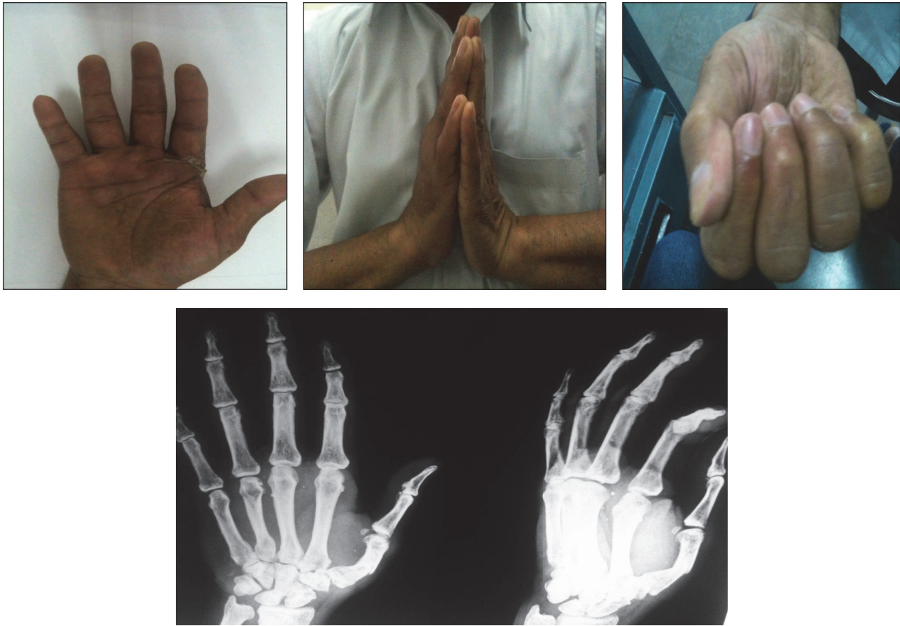
FIGURE 4: Clinical picture and X-ray at 3 months.