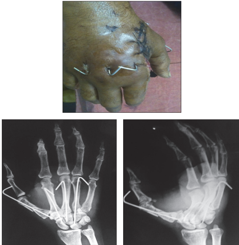
FIGURE 3: Clinical picture and X-ray at 2 weeks.

had a near full range of movement of the hand and wrist, showing good result (Figure 4). The functional outcome was good at latest follow-up at five years with no evidence of CMC joint arthritis.