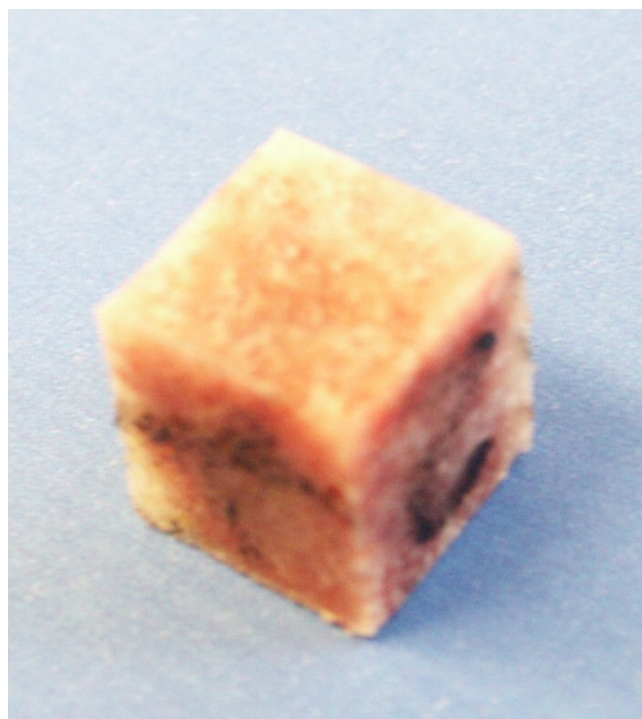
Figure 1 Cubic specimen cut from one canine femoral head.

For sonographic testing, a specially designed device with a custom-made ultrasound transducer (Institute of Materi-