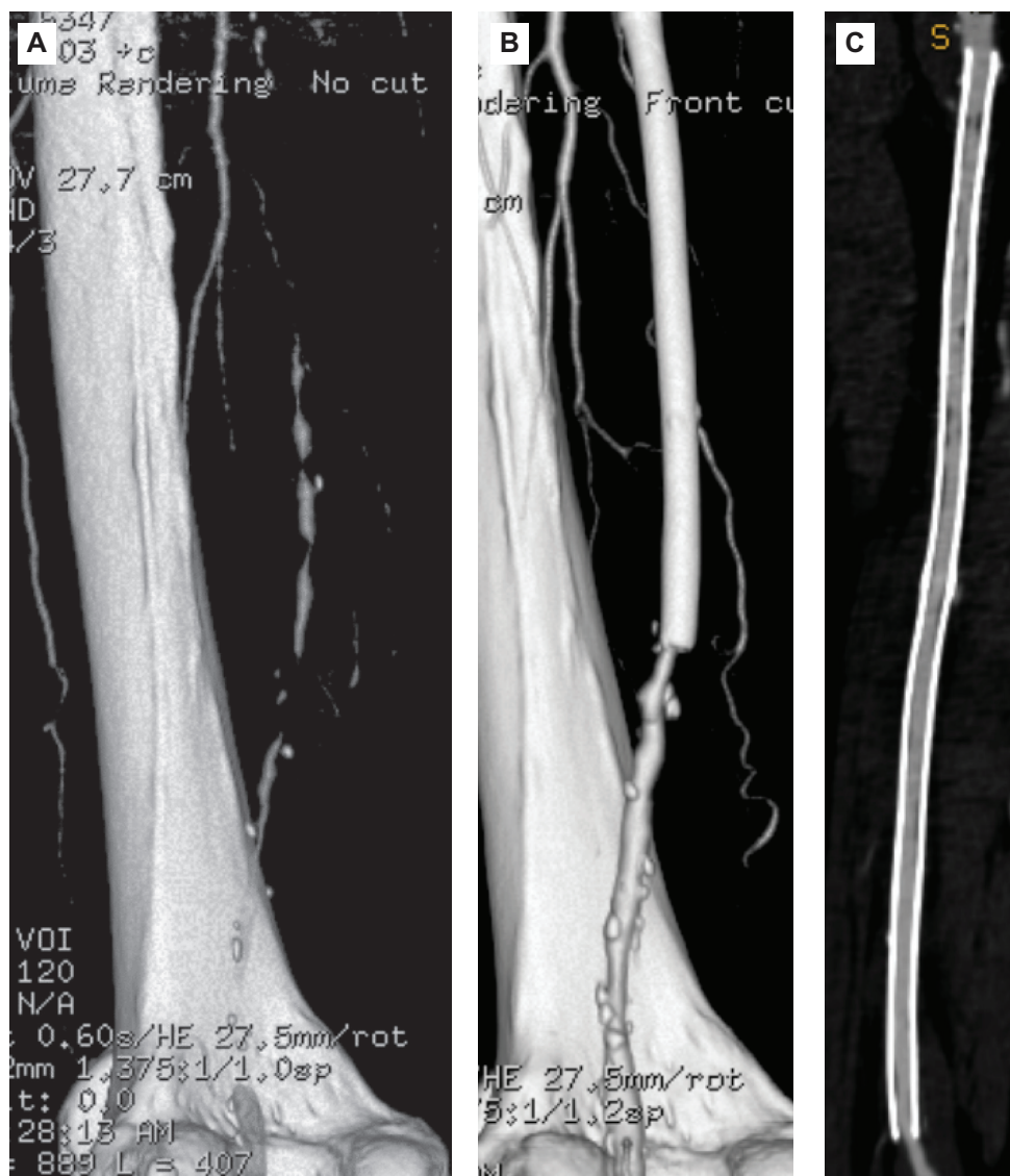
Figure 2 A 79-year-old man in the cilostazol group. (A) CT angiography (CTA) shows left superficial femoral artery (SFA) occlusion. The occlusion length of left SFA is 30 cm. (B, C) CTA obtained 21 months after stent implantation in the left SFA, showing no restenosis.

Many factors affect the primary patency of SFA after stent implantation, including the material and length of the stent, presence of diabetes, distal runoff, and the medication used. It is widely accepted that a nitinol stent is superior to a stainless steel stent for preventing in-stent restenosis. 6,8 While several randomized controlled trials failed to demonstrate any benefit of a stainless-steel stent over PTA alone, 23–27 a randomized controlled single-center trial by Schillinger et al 28 showed that primary implantation of a nitinol stent in the SFA was superior to PTA with optional secondary stenting. Although some reports 4,6,29 have suggested that stent length, diabetes, complete vessel occlusion, and distal runoff affect primary patency, those conclusions are still controversial. There have been some reports 30,31 that low-molecular-weight heparin