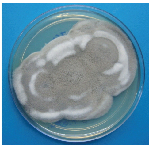
Figure 2: Obverse macroscopic colony morphology of Bipolaris australiensis on Sabouraud dextrose agar after 7 days of incubation at 25°C showed spreading, gray to brownish black, velvety texture colonies