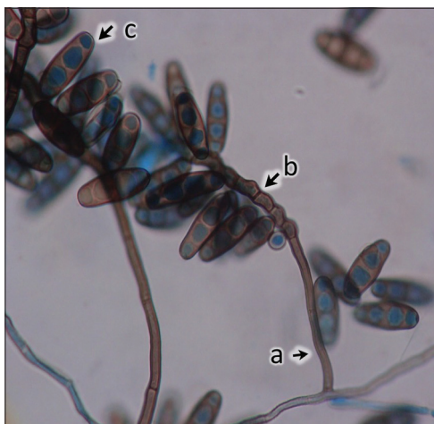
Figure 3: Slide culture mount in lactophenol cotton blue mount showing (a) solitary, smooth-walled conidiophore (b) geniculate and verruculose nodes in conidiophores (c) smooth-walled, ellipsoidal, rounded ends, pale brown, straight, 4–5 distoseptate conidia in clusters (400)

He responded well to the topical therapy. On follow-up, the ulcer was seen regressing and the vision improved to 6/9. Ulcer healed completely by 4 weeks.