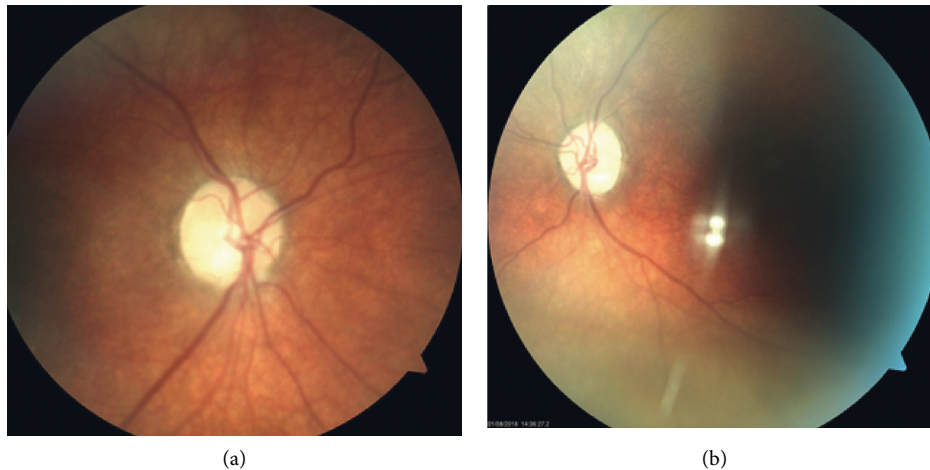
FIGURE 2: Fundoscopic images of retina from two-month follow-up. The left optic nerve (a) is more pale than the right (b). Vision at this time was 20/800 in the left eye and 20/30 in the right eye.

bilateral nature of vision loss in 95% (21/22) of patients and sudden presentation in all patients [1, 3–5]. As with our case, 77% (17/22) of the cases also presented with hypotension, further supporting systemic hypotension as a risk factor for AION. The mean age of patients was 3.3 years. Of the 21 patients available for follow-up, 62% (13/21) had partial vision recovery, as did our patient, and 38% (8/21) remained blind [1, 3–5]. The optic disc pallor seen at presentation in our case has been reported previously in acute pediatric AION related to dialysis [3]. Unique features are that this is the first reported case of pediatric AION during hemodialysis and that it was bilateral, whereas adult AION following hemodialysis typically presents with monocular loss. However, AION following peritoneal dialysis in both children and adults is usually a bilateral disease [3]. This suggests that the mechanism for AION in children may be similar in both hemo- and peritoneal dialysis patients and highlights the need for better screening across all patients.