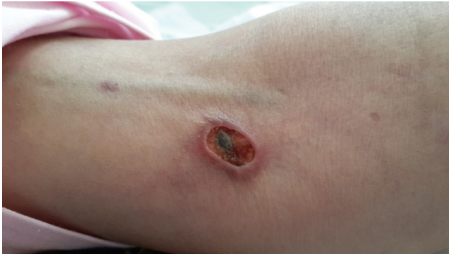
Figure 1. Skin ulcer.