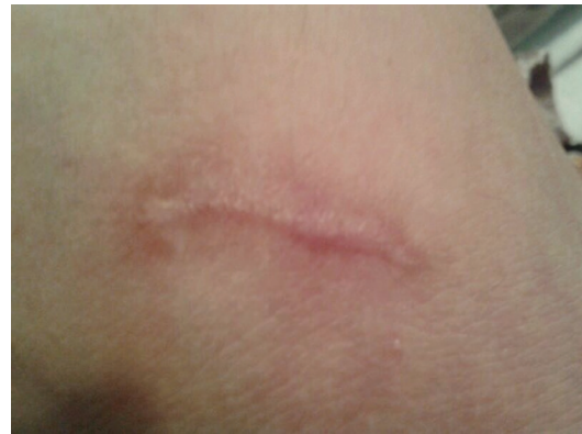
Figure 3. Skin ulcer 3month after treatment.

After a month lesions were healed slightly. After next 3 month lesions were healed remarkably (Figure 3) and there was not indication of fresh rash. Pathology reports were revealed as following: Infiltration of many neutrophil and a few eosinophyl were detected, Rbc extravasation, deposition of complement and IG were observed, transmural