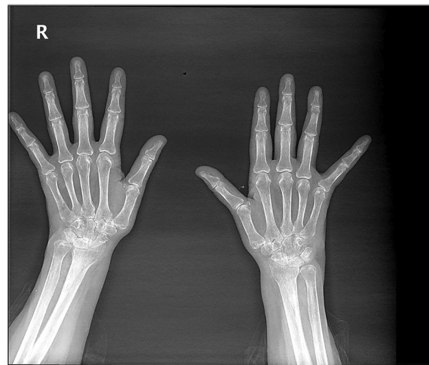
Fig. 4 Joint space narrowing can be seen in the carpal bones and proximal interphalangeal joints, with subluxation in the 5th metacarpophalangeal joint of the left hand. Periarticular osteoporosis can be seen in the metacarpophalangeal and carpometacarpal joints

Electroneuromyography (ENMG) revealed normal sensory and motor nerve conduction studies. Spontaneous activity potentials were observed in bilateral triceps, tibialis anterior, and rectus femoris muscles. Chronic neurogenic motor unit potential (MUP) changes, giant MUPs and widespread MUP loss were detected in muscles. These