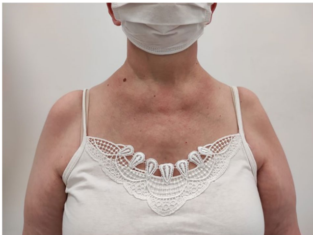
Fig. 2 Physical examination showed a photosensitive lupus rash on the neck and muscle atrophy in both shoulder girdles

Radiological examination revealed changes due to rheumatoid arthritis (Fig. 4). Abdominal ultrasonography, thorax computed tomography and transesophageal echocardiography revealed no pathological findings.