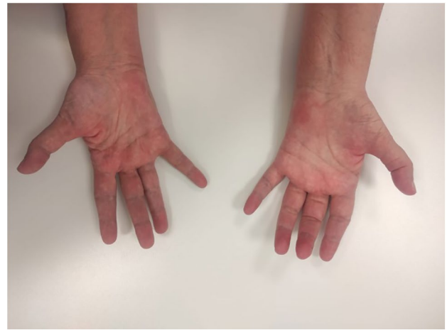
Fig. 3 Bilateral thenar hypothenar and interosseous atrophy of the hands can be seen

In the cranial MR examination, gliotic changes consistent with the patient's age were observed. Bilateral deltoid muscle atrophy was detected in the shoulder MRI examination. No pathological findings were detected on cervical, lumbar, and brachial plexus MRI.