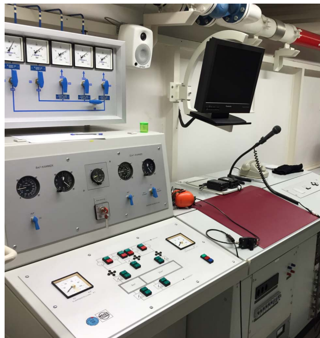
Figure 2 Control room of the hypobaric low-pressure chamber at the Swiss Aeromedical Center, Dubendorf, Switzerland.

In detail, the study is divided into screening (S), baseline (T 0 ), visit 1 (T 1 ), visit 2 (T 2 ) and visit 3 (T 3 ) (figure 3):