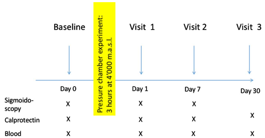
Figure 3 Study design.

Blood is drawn directly before the stay in the hypobaric chamber. Patients then enter the hypobaric chamber (ascent within 10 min, 3-hour exposure to hypoxic conditions simulating an altitude of 4000 m.a.s.l. (FL 13 000 ft.) afterwards controlled descent under continuous pulse oximetric control). During the 3-hour stay in the hypobaric chamber, repetitive measurements of the bladder volume are performed (5 min after reaching the altitude of 4000 m.a.s.l., and at time points 30, 45, 60, 120, 180 min and after the descent) by ultrasonography. Directly after the stay in the hypobaric chamber, blood is drawn again. A sigmoidoscopy from the sigmoid region is performed (at the latest 2 hours after leaving the hypobaric chamber) and six biopsies, remote of previous areas, are collected.