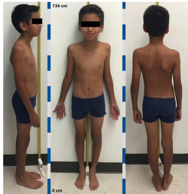
Figure 1 Physical examination. Abnormally low short stature, 134 cm (−14 SDS below 3rd percentile for age).

Throughout his childhood, he presented short stature, referring to always being the shortest in his classroom,