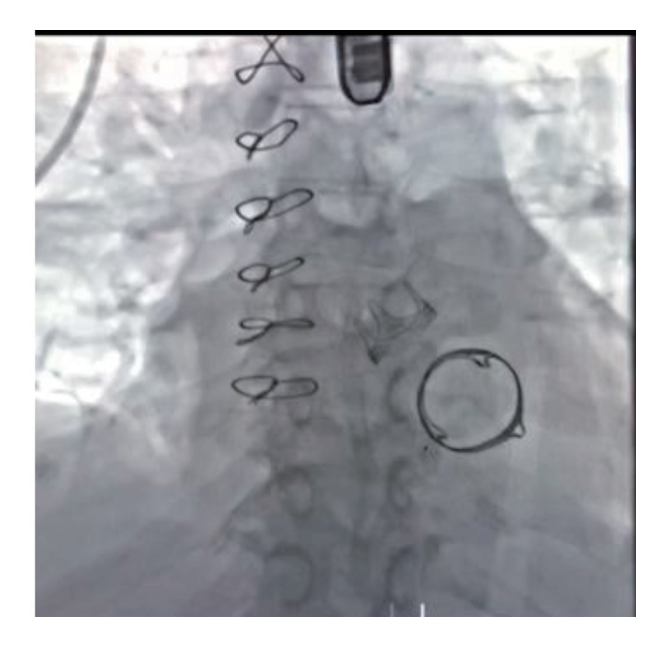
Figure 1. Cardiac fluroscopy before procedures showing previous bioprosthetic mitral and aortic valves.

RV apex via the left femoral vein. TAVR 23-mm Edwards Sapien S3 was to be placed via right femoral artery. TMVR was to be done using the 29-mm Edwards Sapien S3 (TAVR valve) in the mitral position. Right common femoral venous access and LV puncture was completed. Initial fluoroscopic image with old bioprosthetic mitral and aortic valves was obtained (Fig. 1). Following left ventricle puncture, an exchange-length Glidewire was passed through the sheath into the LV and into the left atrium. In the next step, an 8.5 SL1 sheath was passed over the J-tip core wire into the right atrium. The BRK XS trans-septal needle was passed to the SL1 sheath. Trans-septal puncture was performed with subsequent placement of the SL1 sheath in the left atrium.