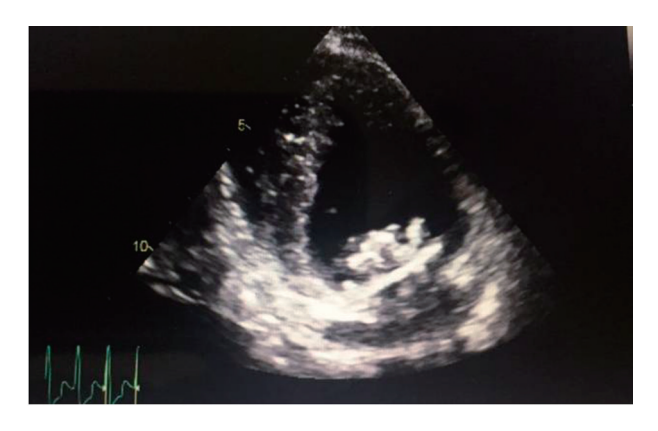
Figure 5. Follow-up transesophageal echocardiogram with left atrial thrombus.

lished that bioprosthetic valves have a shortened lifespan in younger patients, arguably due to a more robust immune response, and heightened hemodynamic stress. Both the shortened durability of valves and longer life expectancy in younger patients may contribute to a higher incidence of subsequent repeat valve replacement in the future. Although re-operation is the current standard of care, this carries a significant risk of mortality and morbidity [4]. Therefore, new procedures such as TAVR, TMVR and TDVR could potentially be considered as viable alternatives in high-risk patients.