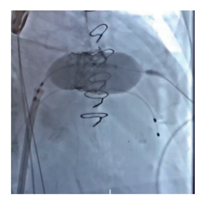
Figure 2. Balloon inflation and transcatheter bioprosthetic mitral valve deployment.

Multiple attempts to cross the aortic valve with the straighttip wire were unsuccessful via the femoral artery approach.