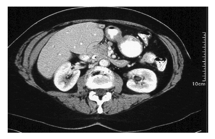
FIG. 1. Computed tomography scan of the bile duct mass. The image shows an enhancing mass in the porta hepatis.

2a, 2b). Sections of the adjacent liver showed variable bile duct proliferation, focal bridging and periductal fibrosis, and cholestasis. Immunohistochemistry revealed neoplastic cells that were positive for S100 (Figure 2c), CD1a (Figure 2d), CD68, CD14, and lysozyme. Electron microscopy of the tumor cells demonstrated the presence of Birbeck granules (Figure 2e) in the majority of histiocytes examined. These findings confirmed the diagnosis of LCH. The patient underwent a whole-body imaging to look for other areas of disease involvement, but the studies were negative. The patient received adjuvant chemotherapy with 5 courses of cladribine and was disease-free for 14 months after which she developed bacteremia due to a polymicrobial biliary infection from a chronic indwelling biliary drain. On admission, imaging studies did not reveal any evidence of malignancy. The