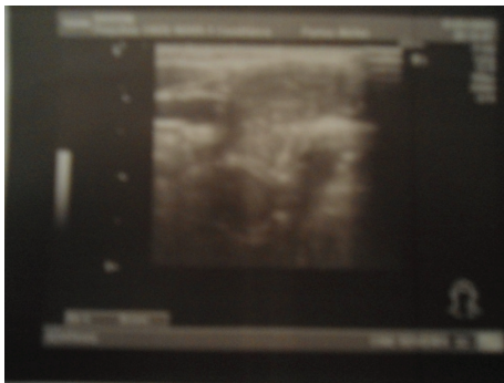
FIGURE 2: High resolution ultrasonography: right thyroid lobe having a hypoechoic, heterogenous.