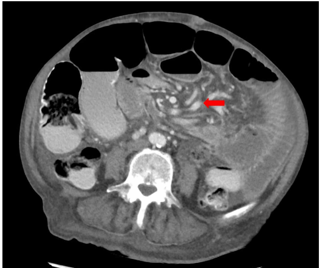
FIGURE 3: Post-operative axial slice of abdominal computed tomography (CT) in portal phase demonstrating recurrence of “whirlpool sign” of mesenteric vessels, suggestive of small bowel volvulus (arrow) with dilated loops of small bowel

from the duodenal-jejunal flexure to terminal ileum. A simple devolvulation was performed and approximately one litre of small bowel content was milked retrograde into the stomach and drained via the NGT. The abdomen was closed thereafter with 1-0 polydioxanone suture (PDS) to fascia and 3-0 monocryl to skin. Her admission was complicated with a line-associated deep vein thrombosis despite supratherapeutic INR levels and had transient recurrence of her abdominal distention resolving with regular twice daily rectal enemas and temporary reinsertion of NGT. She was discharged on day seven post-operatively symptom free and with opening bowels. She re-presented with a similar history, clinical signs, and abdominal CT scan on day 11 post-operatively (as seen in Figure 3) which was treated successfully with regular rectal enemas and insertion of NGT; she was discharged symptom-free with a non-distended abdomen on day eight of re-admission (day 19 post-operatively).