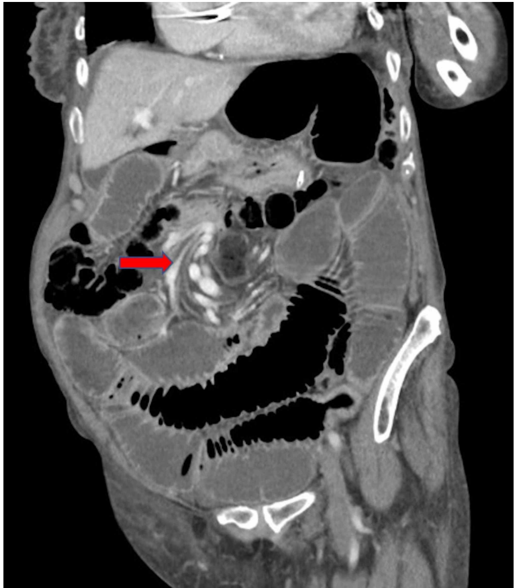
FIGURE 2: Coronal slice of abdominal computed tomography (CT) after contrast media administration, in portal phase demonstrating “whirlpool sign” of mesenteric vessels, suggestive of small bowel volvulus (arrow) with dilated loops of small bowel

A nasogastric tube (NGT) was inserted with drainage of bilious contents and mild relief of distention. An indwelling catheter (IDC) was inserted for fluid balance and fluid resuscitation was commenced. Warfarin was reversed with prothrombinex and operative exploration was pursued to exclude abdominal catastrophe. A laparoscopic approach was not feasible due to marked distention in a very thin individual and so a decision was made for exploratory laparotomy. Intraoperative findings demonstrated marked small bowel distention with mesenteric twisting in the right abdomen involving the ileum, with collapsed colon distally and hard stools palpable within the colon. No adhesions or congenital bands were noted that would have accounted for the volvulus and a complete small bowel run showed healthy viable bowel