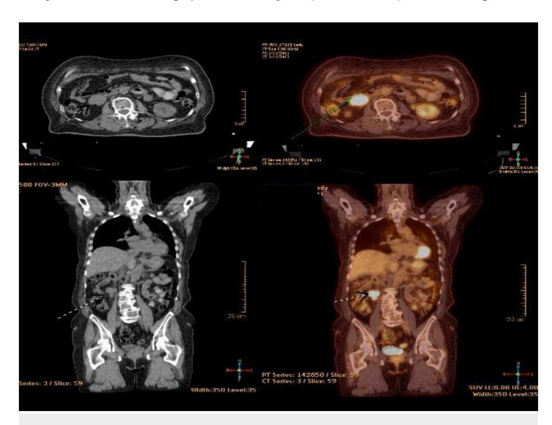
FIGURE 1: Baseline PET-CT showing the right retroperitoneal mass.

Four months after completion of RT, PET-CT demonstrated resolution of all irradiated regions with the emergence of new metastatic lesions in the left supraclavicular region (max SUV = 5.4) and right femur (max SUV = 10.6). In addition, the PET-CT showed a new 2.8 \times 4.1 cm right retroperitoneal mass with highly intense FDG uptake (max SUV = 10.2) as shown in Figure 1.